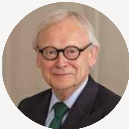
Lord Deben Chairman Climate Change Committee