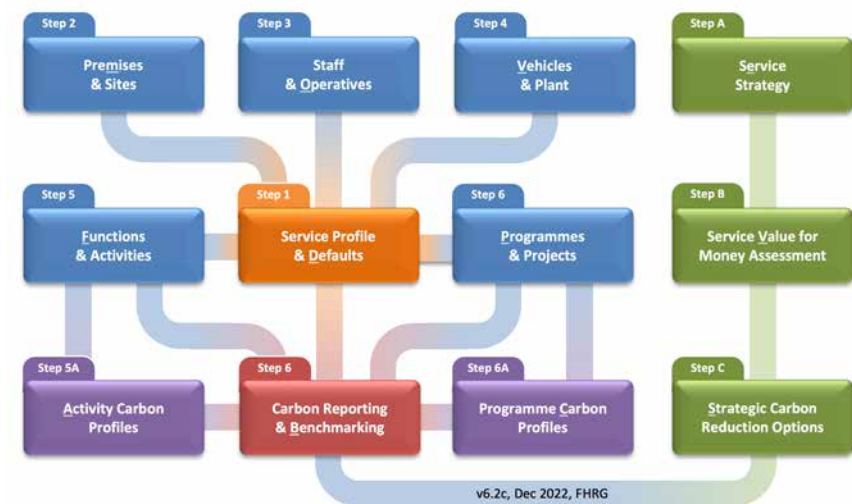
Figure 1: Carbon Analyser: CCAS Route Map

To help LHAs, the CCAS is supported by Carbon Analyser , a web-based carbon profile builder and carbon calculation application, tailored for highways services. Carbon Analyser provides end-to-end support for the CCAS process, from service strategy formulation to carbon benchmarking, as illustrated in Figure 1.